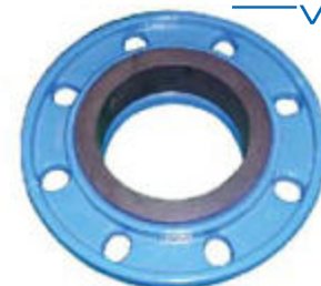
For PVC pipe