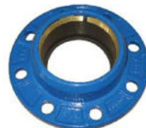
For PE pipe